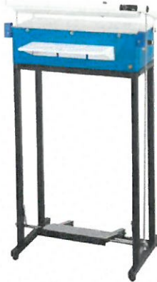
18", 24" 3mm Foot Sealer w/ Cutter