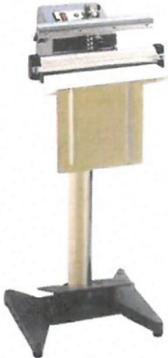
12", 14", 18", 24", 26" 2mm, 5mm, 8mm Foot Sealer