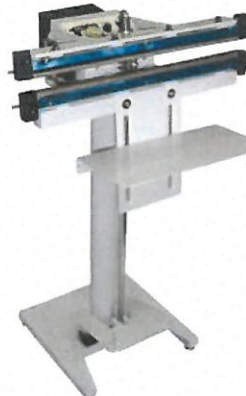
12", 18", 24" 5mm Double Foot Sealer