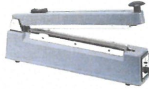
8", 12", 16", 20" 2, 2.6, 5, 10mm Hand Sealer w/ Cutter