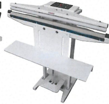
30", 35" 2.7mm Long Foot Sealer