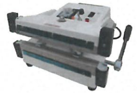
10", 10mm Double Hand Impulse Sealer