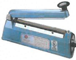
4", 2mm, 5mm 8", 2mm, 5mm, 10mm Hand Sealer