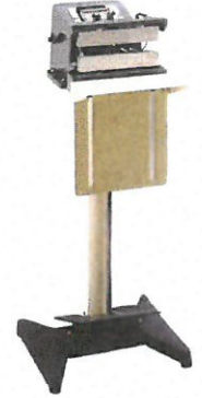
8", 12", 16" 15mm Direct Heat Foot Sealer