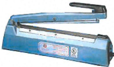
12", 16", 20" 2mm, 5mm Hand Sealer

Your One Stop Source for Sealers and Shrink Wrap Systems