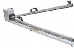
24", 26", 30", 32", 40", 59" 2.7mm Long Hand Sealers w/ and w/o Cutter